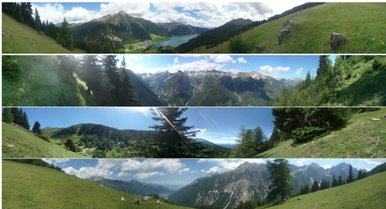
Figure 2: Examples of highly rated pictures from the perception survey (from Schirpke et al., 2016) 13) .

1) Daniel TC. Whither scenic beauty? Visual landscape quality assessment in the 21st century. Landscape Urban Plan. 2001, 54, 267–281.